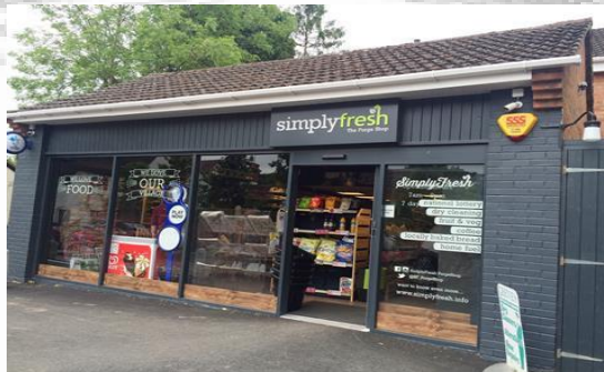
The Forge Shop, 2019