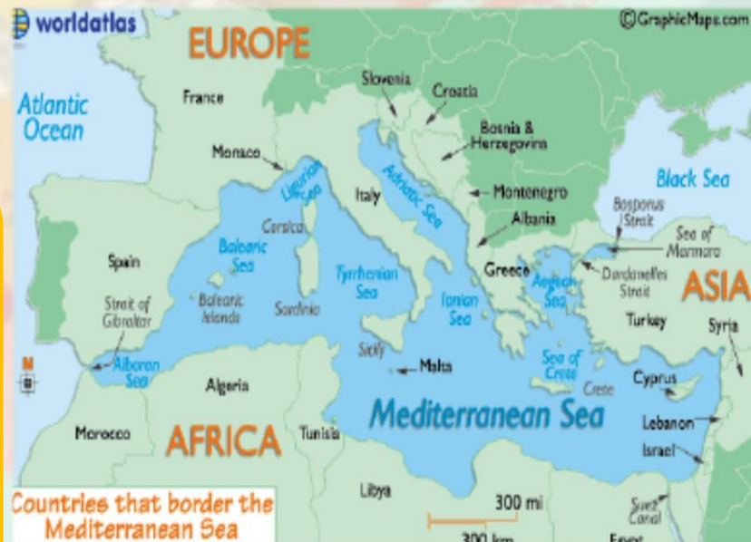
Countries that border the Mediterranean Sea

Mediterranean climate is a very pleasant climate with warm, dry summers and cool, mild winters. It gets its name from the Mediterranean Sea. Most of the coastal land around the Mediterranean Sea experiences this climate.