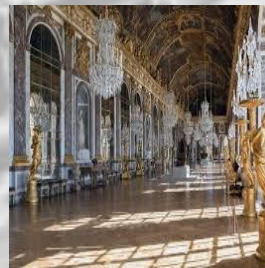
(left) Palace of Versailles- where terms for ending World War One was signed. (right) Geographical location of the Somme

Women were not allowed to fight as soldiers in World War One. So they found other ways to help on the front line. Conditions were dangerous for women travelling to the war zones. They were at risk from enemy fire. After working long hours, they slept on uncomfortable camp beds and had to be up early for duty.