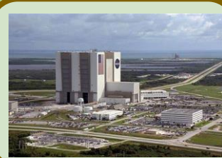
Places of National Interest

(Above) Kennedy Space Centre/USA for learning all about space travel and the planets