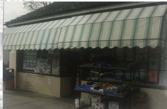
The Forge Shop, 2006