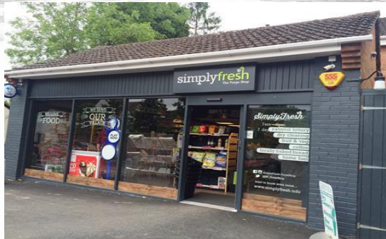
The Forge Shop, 2019